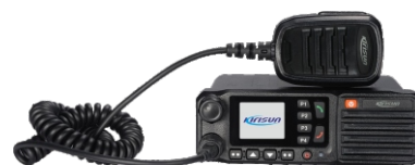
TM840 DMR MOBILE RADIO

For more information, please visit www.kirisun.com or contact marketing.os@szkirisun.com