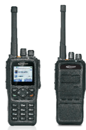
DP990/995 DMR PORTABLE RADIO

For more information, please visit www.kirisun.com or contact marketing.os@szkirisun.com